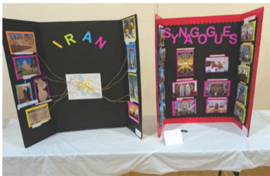
M'Arba Kanfos Ha'Aretz Fair Exhibit.