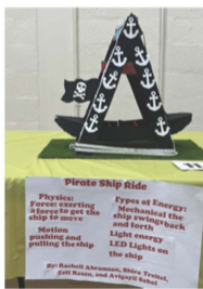
STEM Fair Exhibits.